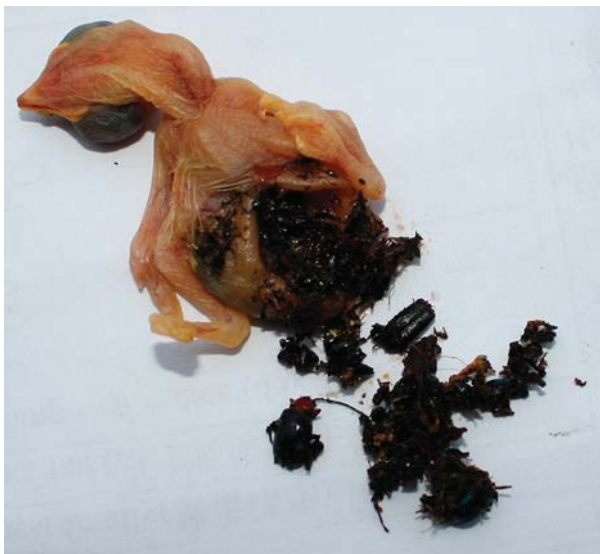
Figure 2. A dead common cuckoo nestling filled with insects containing thick exoskeletons that remained undigested.

We examined the dead nestlings ( n = 4 ) and found that their stomachs were filled with undigested insects with thick exoskeletons, identifiable items including beetles (Coleoptera) and grasshoppers (Orthoptera; Fig. 2). By contrast, all flycatcher nestlings ( n = 6 ) survived after they were introduced into the nests of other passerine species (Supplementary material Appendix 1, Table A1). The results were clear-cut (survival of foreign chicks in flycatcher nests [0% of 12 cases] versus flycatcher chicks in foreign nests [100% of six cases]: Fisher's exact test: p < 0.0001 ) and consistent across a wide phylogenetic spectrum of species (Supplementary material Appendix 1, Table A1).