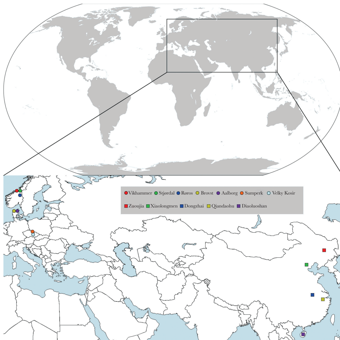
Figure 1 Locations of study sites. Circles and squares refer to study sites in Europe and Asia, respectively.

In Europe, only the common cuckoo was sympatric in some populations. In China, the 3 most common sympatric brood parasites were the common cuckoo, Himalayan cuckoo Cuculus saturatus , and